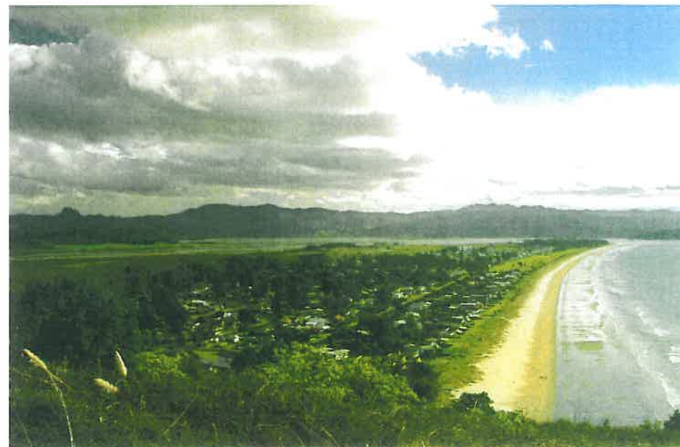
Matarangi Beach from the Bluff

What Do I Need To Know How Will I Know What Do I Do