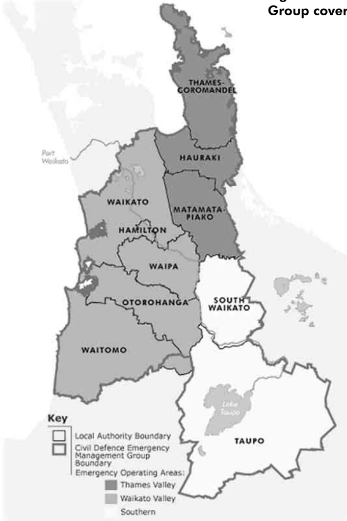
Figure 1 2: The Waikato CDEM Group coverage area.

An EOC is effectively a location where emergencies will be physically managed from. If it's a really big event (for example, if the emergency affects more than one EOA), a Group Emergency Operating Centre (Group EOC) will manage it. The Group EOC is based in Hamilton and is co-located with the Waikato Valley Emergency Operating Area EOC.