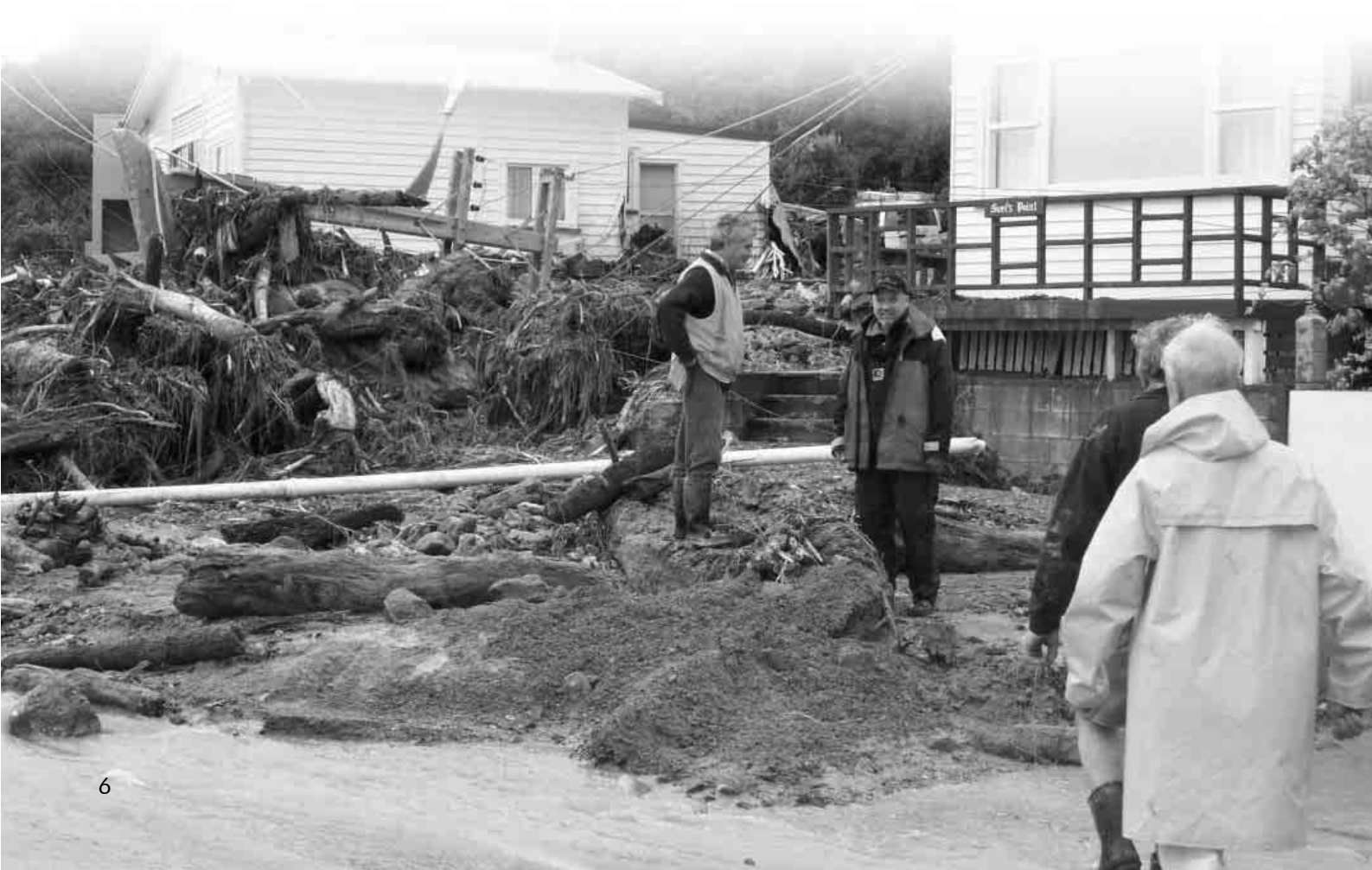
Weather bomb on the Coromandel Peninsula

The Proposed Plan is a good starting point that we can ALL build upon. Its success lies in all agencies and people working together so that we are collectively better equipped to handle any type of emergency in the Region, creating stronger, safer and more resilient communities.